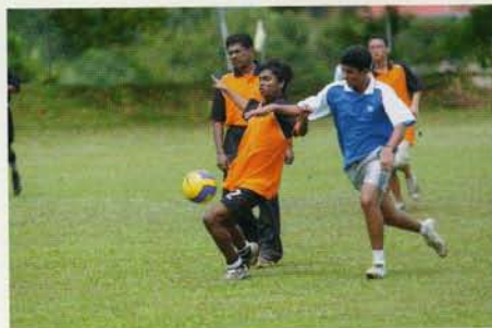
Juniors in action