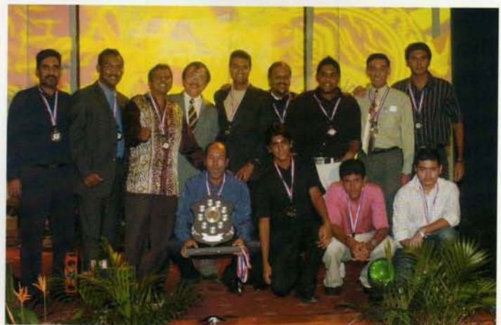
Football Champions - North