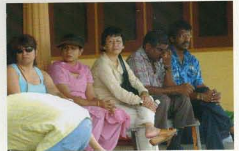
These ladies wear Prada