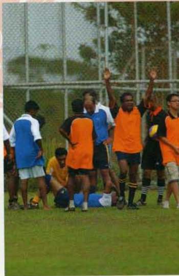
Any doctors around?