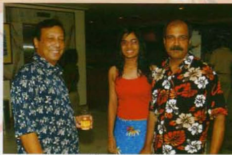
My shirt is better lah