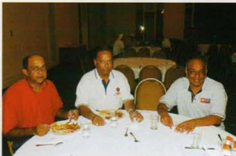
12noon -3 pm-Members enjoying lunch