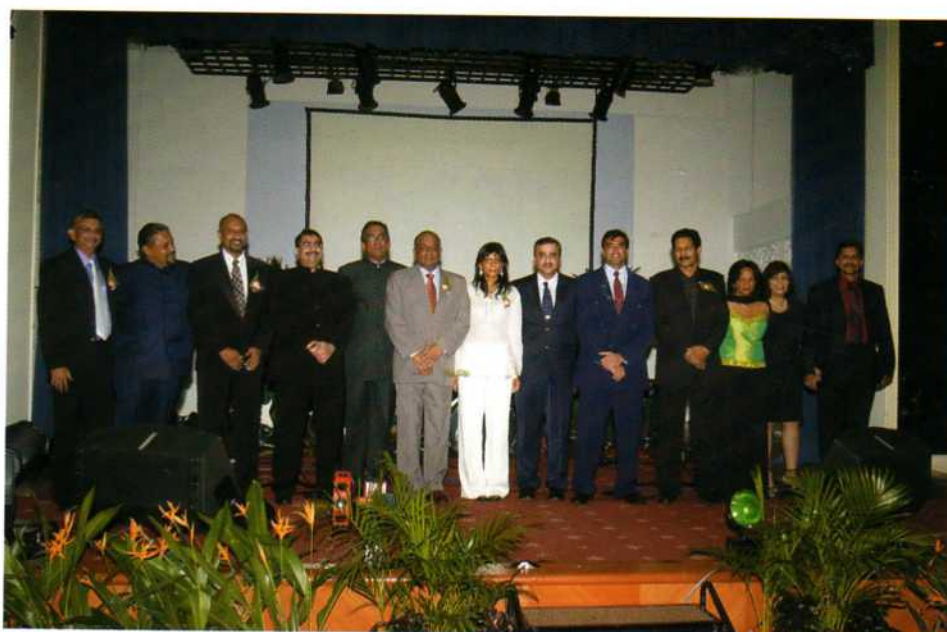
The dream "Come Together 2" team takes a bow

All captions were done in good faith-so please enjoy.