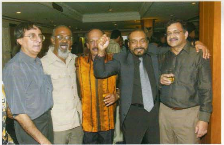
We will be back!