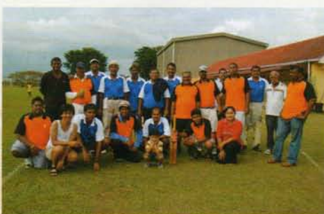
6pm-One for the camera