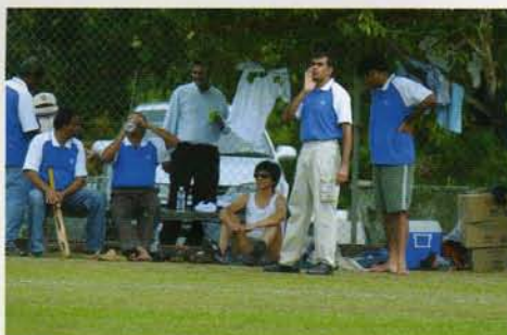
Supporters turn unruly