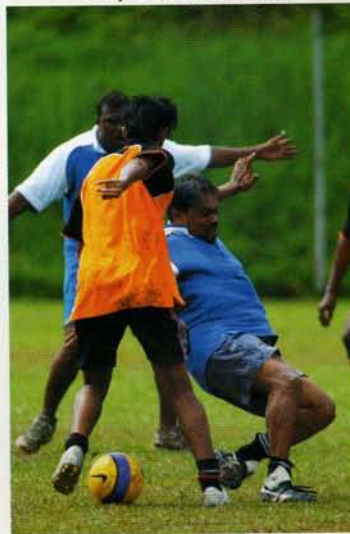
Selva damages turf