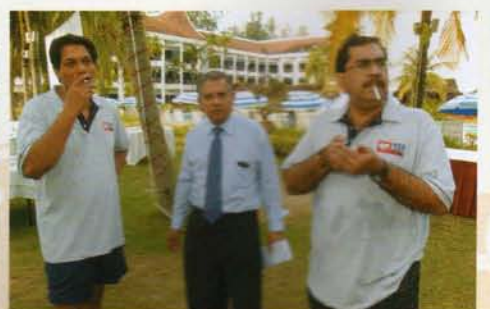
7pm - Rain dampens beach party