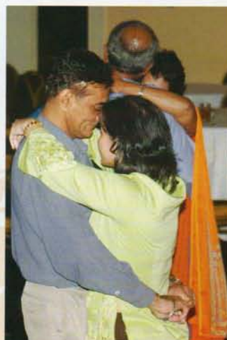
Romancing the stoned