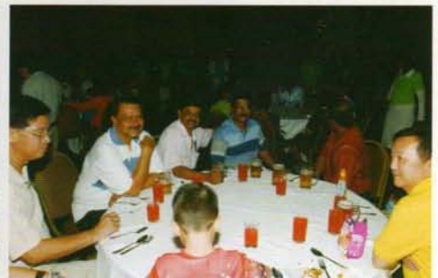
Where is the food meh?