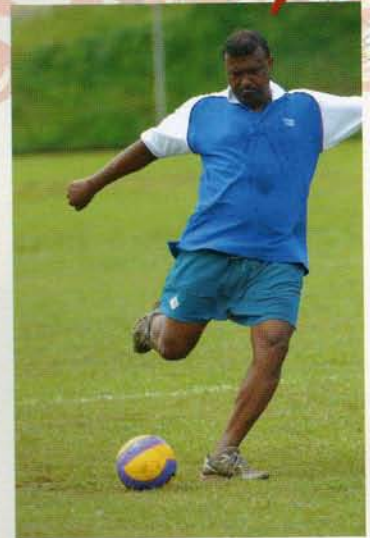
Kenny Daglish wannabe