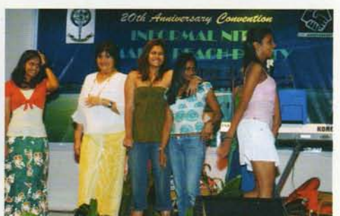
Ms Manipal Babe Night