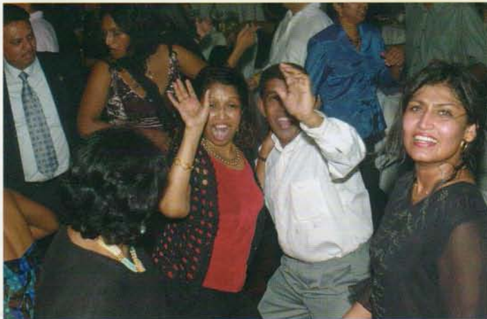
We will be back too!