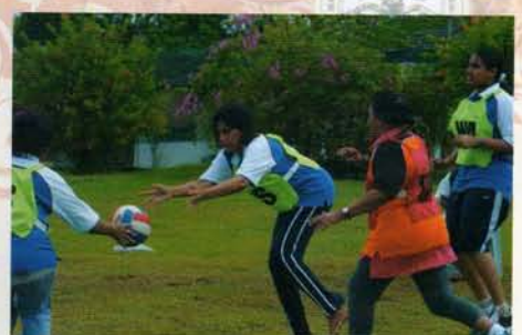
Our girls on heat