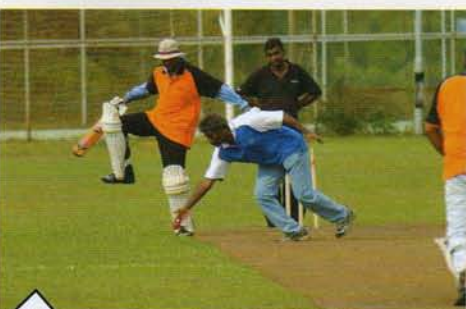
Bot Acha Catch