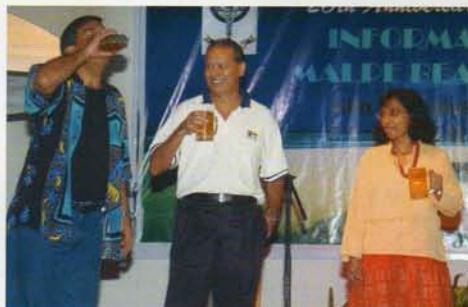
Beer drinking contest