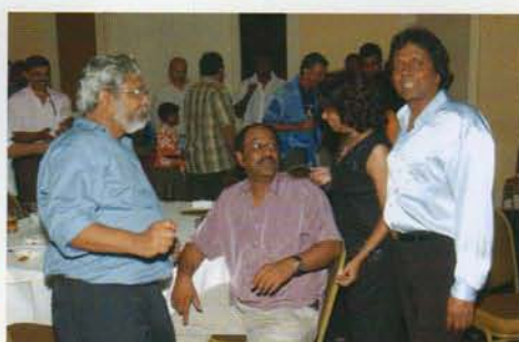
Settling old disputes