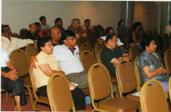
CPD- nap time