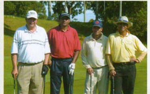
6am-12 noon Convention kicks off with PGA Golf Waiting for 19th hole guys?