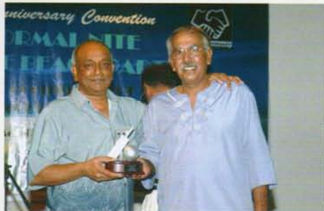
Cosmo-man of match cricket