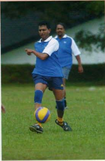
Mano sambas again