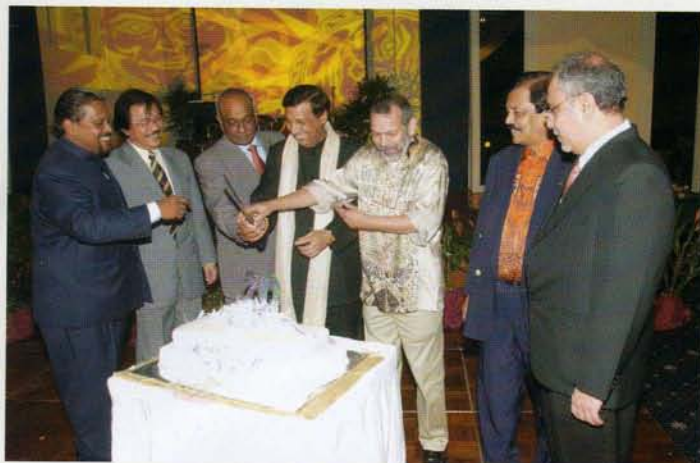
Past Presidents honoured