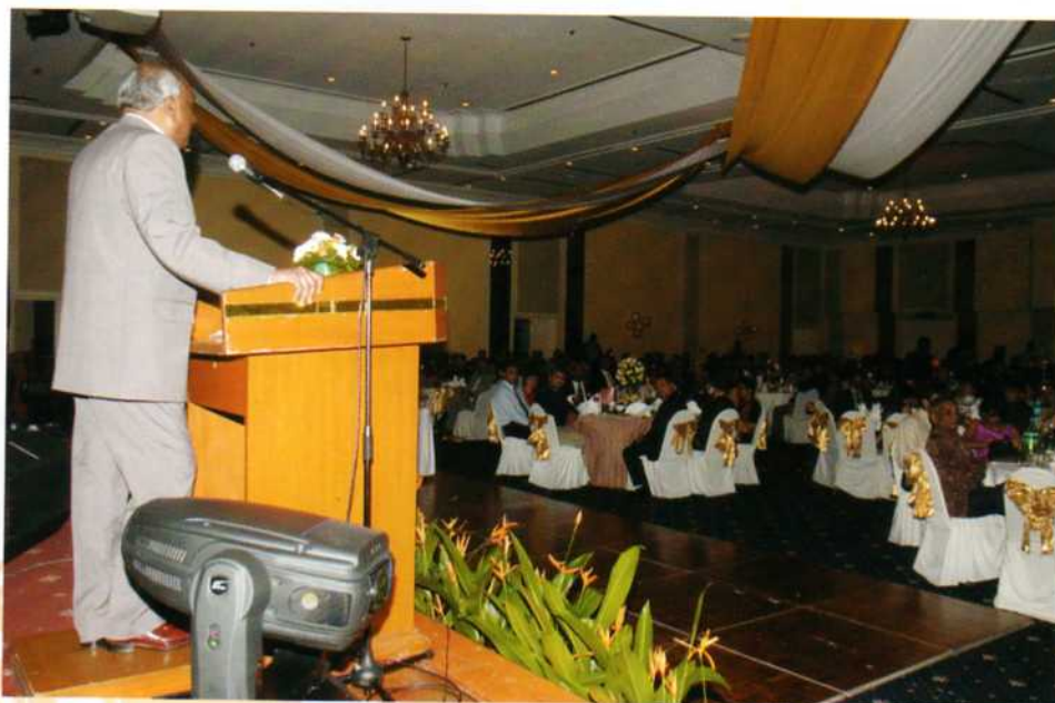
Night in dazzling Satin