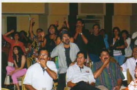
Booze takes its toll