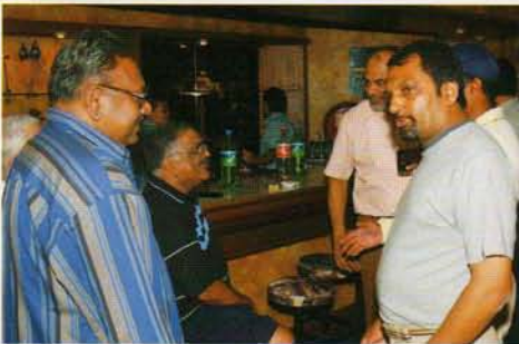
1pm-8 pm-Indian brotheroos @ hospitality suite