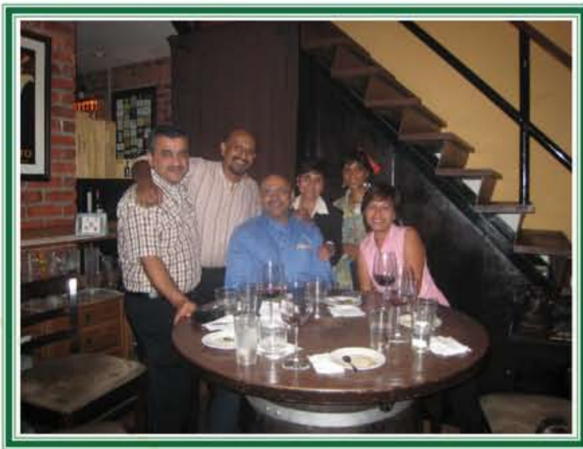
Good wine & Great company

3) What have been your golden and worst moments in ING? Its all been challenging but really interesting as a whole new world opened up. I suppose the Golden moment would be now that I have been recognized & been given the position to lead the company.