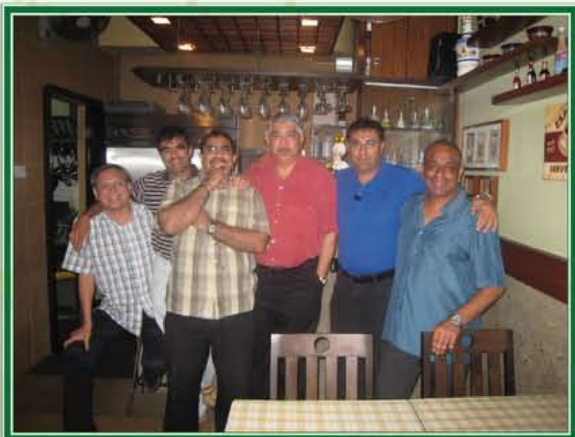
Big Boys Play At Night!

Please bear with us and the hotel front desk staff. We understand that many of you will be exhausted from a long drive but please-no excuse to be rude lah. Please note that all hotel bookings for residential package ONLY will be managed by us. You are also required to register yourselves with us