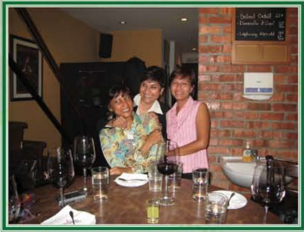
Heart Ripping Babes

And anything else that has made that tiny little difference in your life?