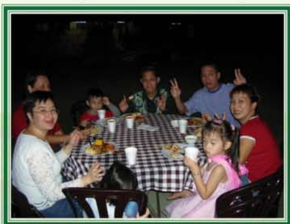
MCA Cawangan MAAM