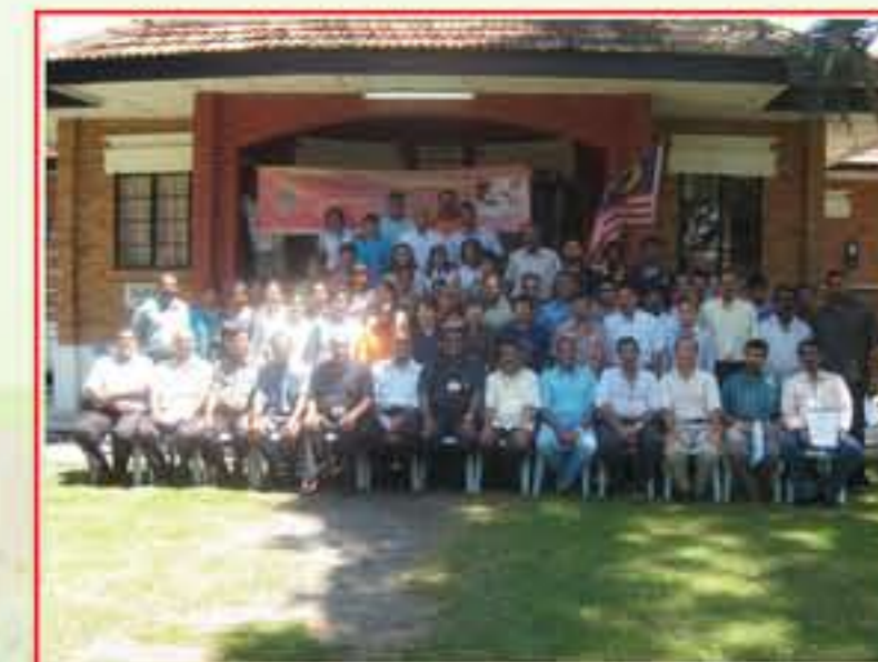
TQ, Bye & See U next year.