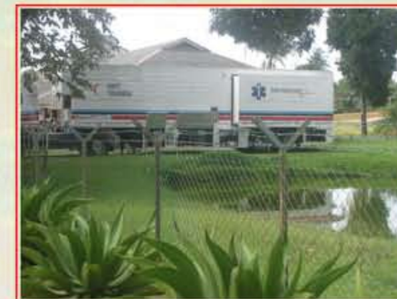
13m. 1.2 million Mobile Trauma Unit