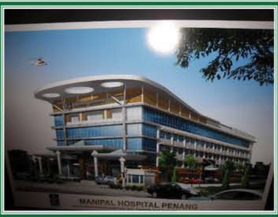
Manipal Hospital Penang 2010