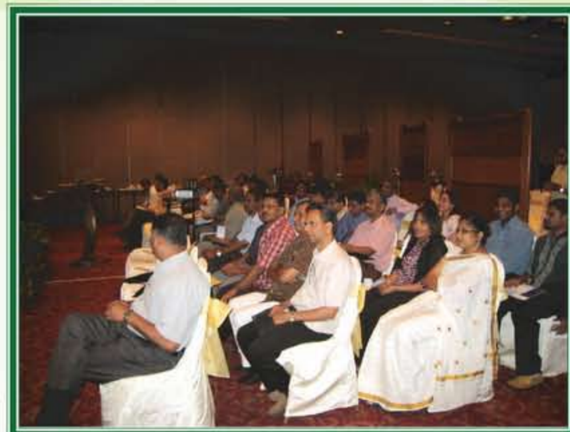
Rapt attention ...or nearly

The President and MAAM Committee would like to extend our deepest appreciation to all our members for the awesome response to our "souled out" CPD held on 09-09-07 at PJ Hilton. We showcased 4 excellent speakers viz.