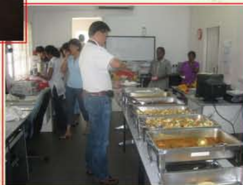
Estate Chefs (background)