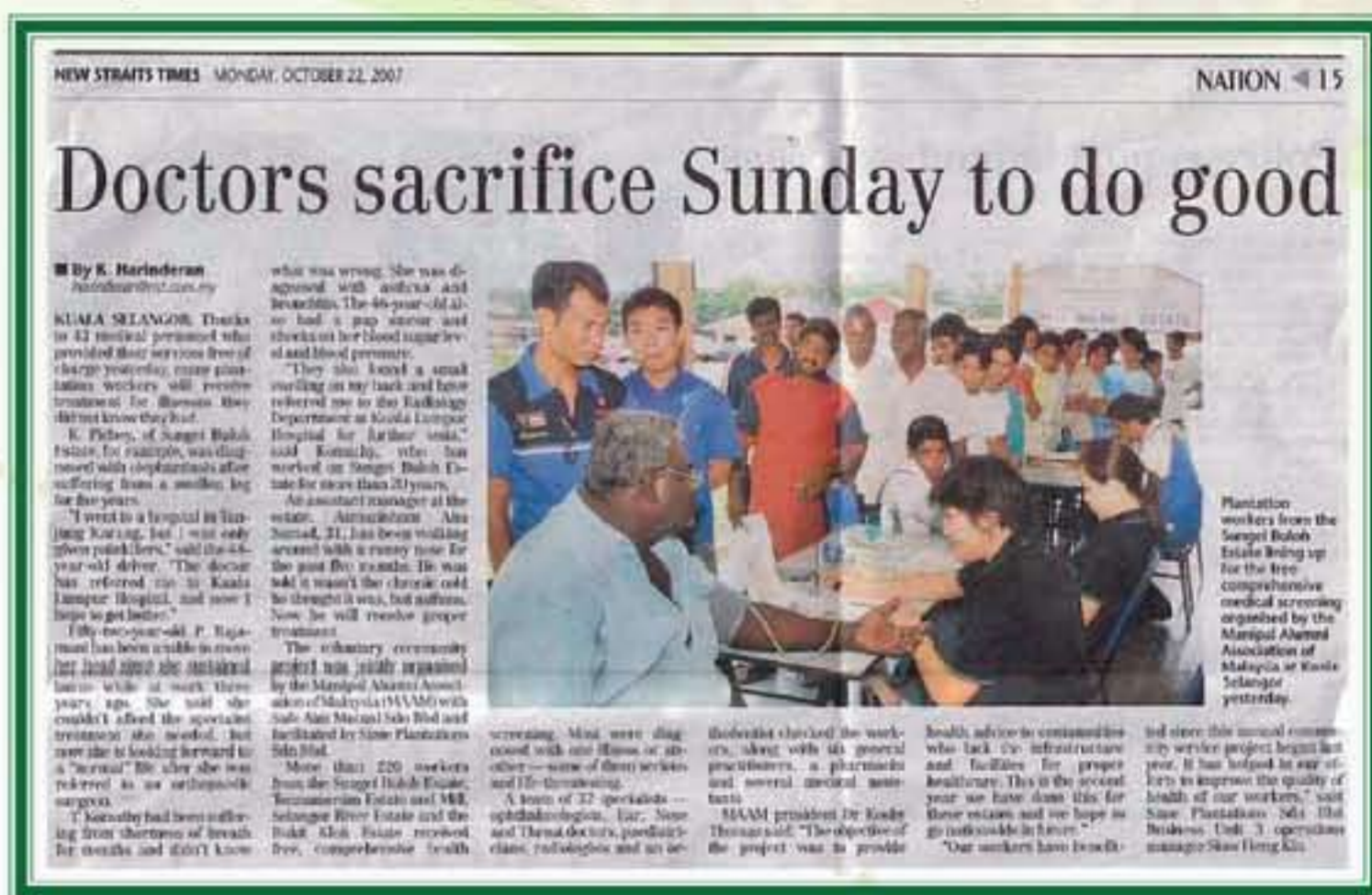
Need I say more