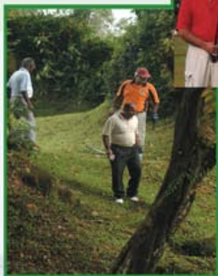
CSI & C4