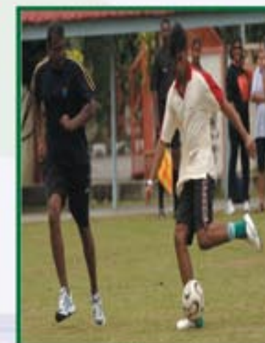
Man of the Match