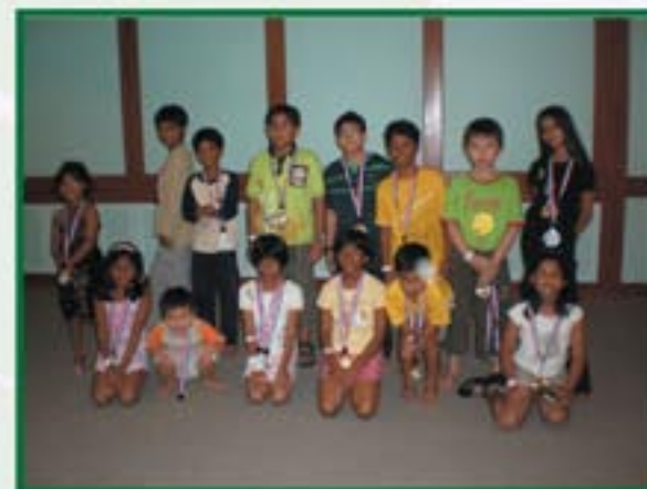
Our Junior MAAM Olympians

Cricket: Held at the Penang Free School field on 14.12.07- at 3.30 pm. Trophy named as the Dr Thayahlan's Memorial Trophy.