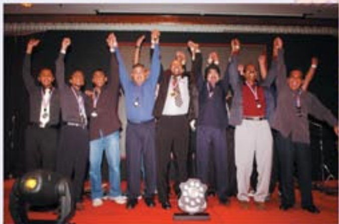
Football Champions SOUTH