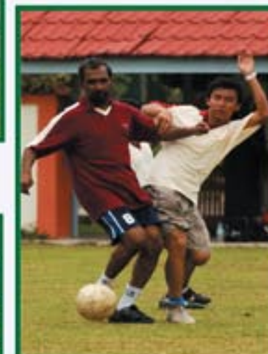
Out of my way