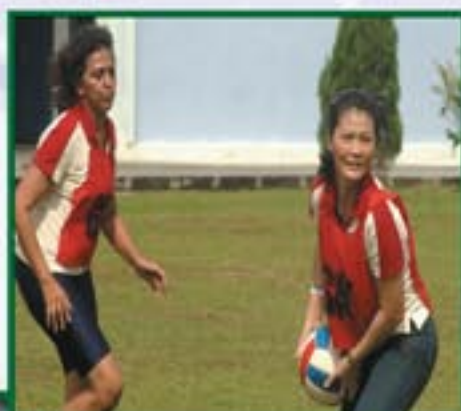
Long cool Women