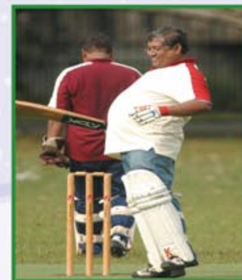
Hootie & the Blowfish