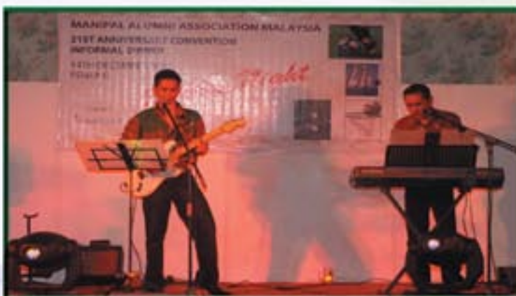
The Incredible Zarsadias