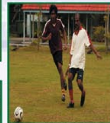
Custer-The Last Stand