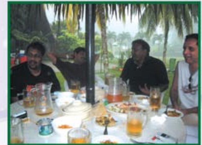
Beering in the Rain

Sunday breakfast on the 3rd day and everybody were ready to depart albeit with some sad see you next year sentimental farewells....actually not everybody-afew stayed back and held a ceramah under the cabanas beering in the rain.That was the closing barrel for the convention and we finally wound up at about 10pm.with the usual trustworthy stengahs.