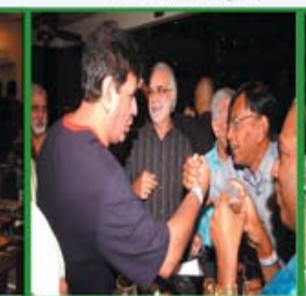
The Arm Dealers