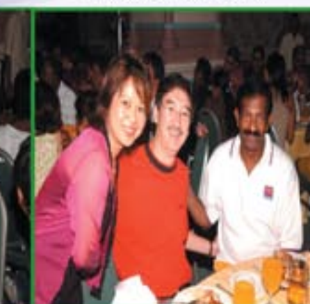
The Perfect Strangers