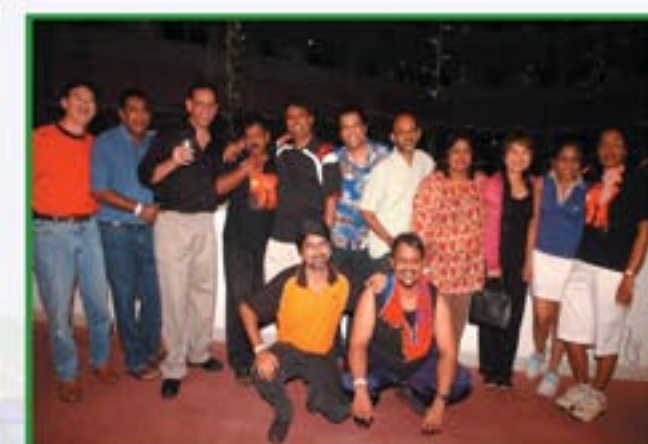
The original HEROES