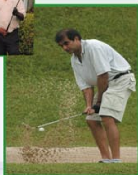
The Constant Gardener