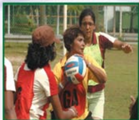
The Desperate Housewives