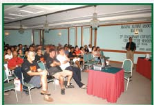
Just before Happy Hours