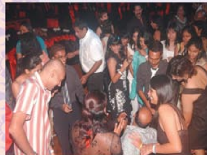
You can't kill the Beast