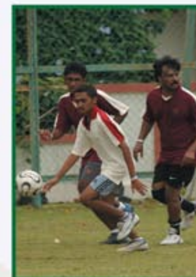
Sally can wait