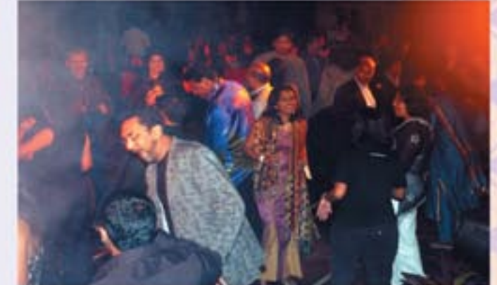
My hips don't lie