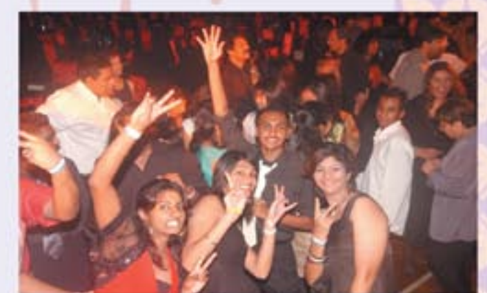
Going down swinging