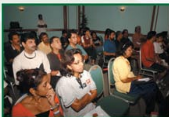
Hmmm what to wear tonight