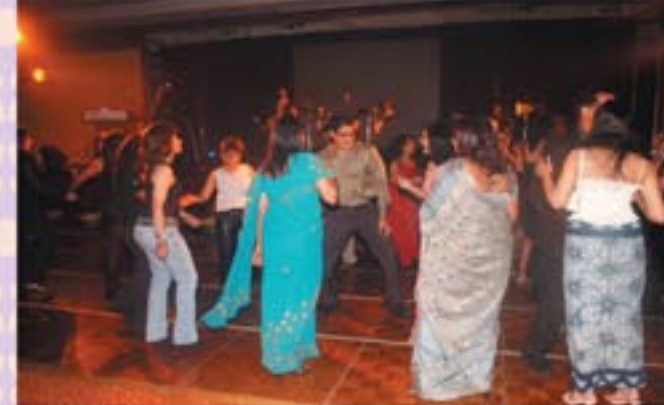
Wanna be starting something