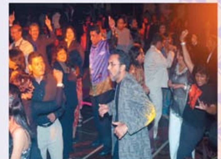
You can stand under my umbrella