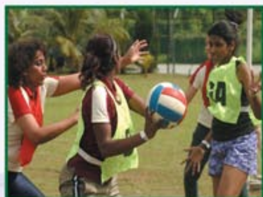
Check my claws