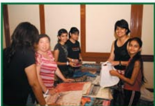
MAAM Pasar Malam