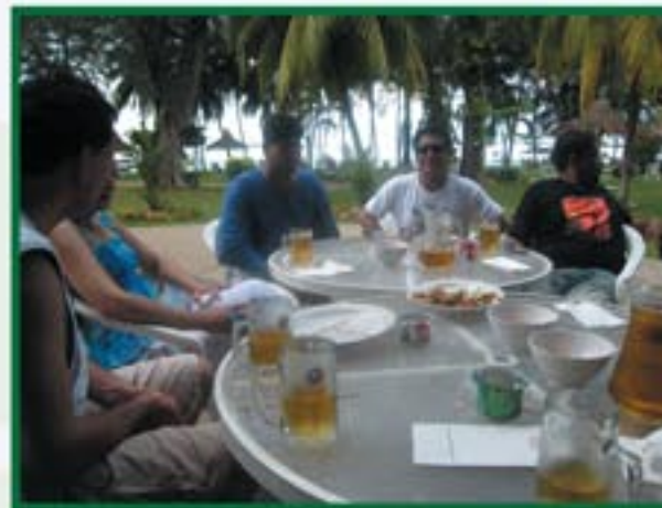
Ceramah Cawangan MAAM

On the 13th Dec ie. a day before the convention we were pleasantly surprised to see a sizable no.of participants check-in at the hotel.