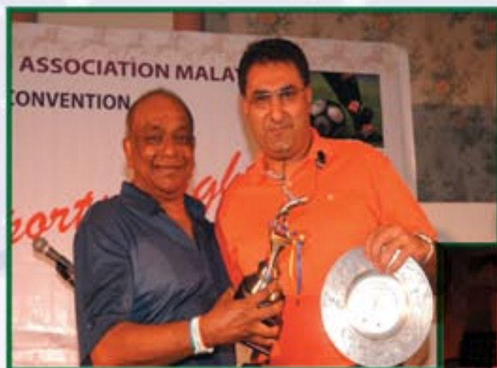
Next stop PGA