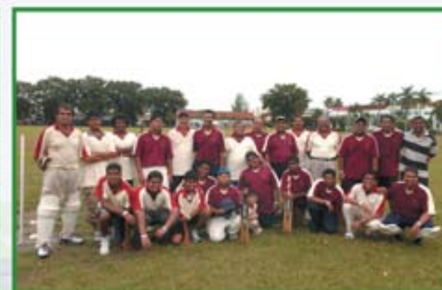
Free School Grounds