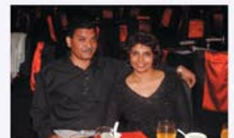
Rhett & Scarlet