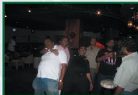
Casualties of the Bar