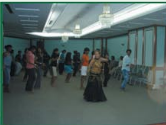
Belly Dancing CPD for Ladies