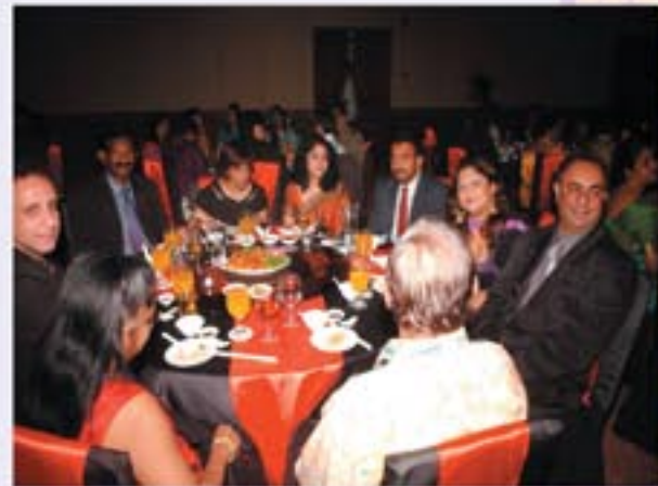
Good Times Roll