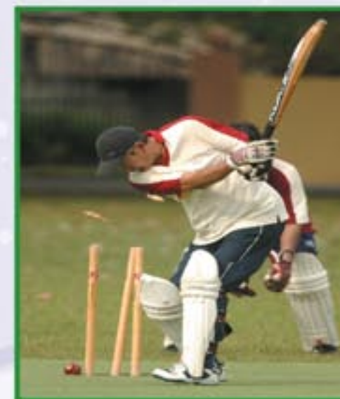
Get down on it