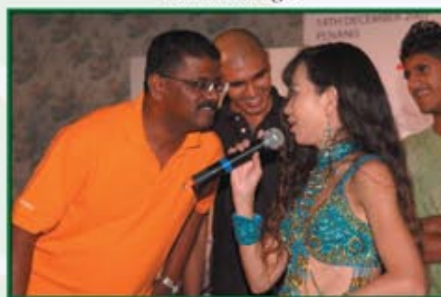
Closer you get