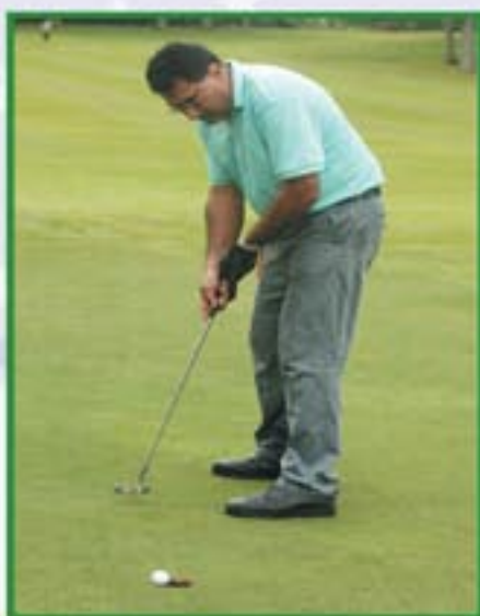
"Tiger Beer" Mupin