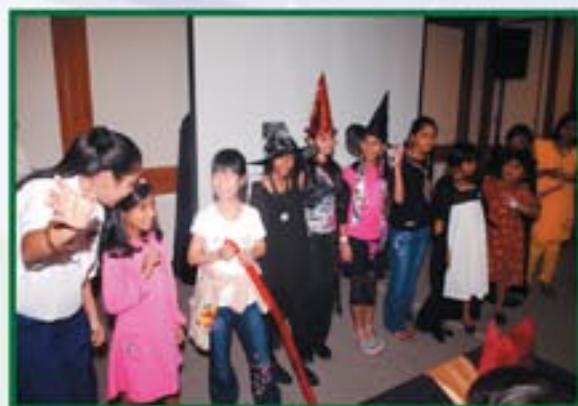
Harry Potter Party