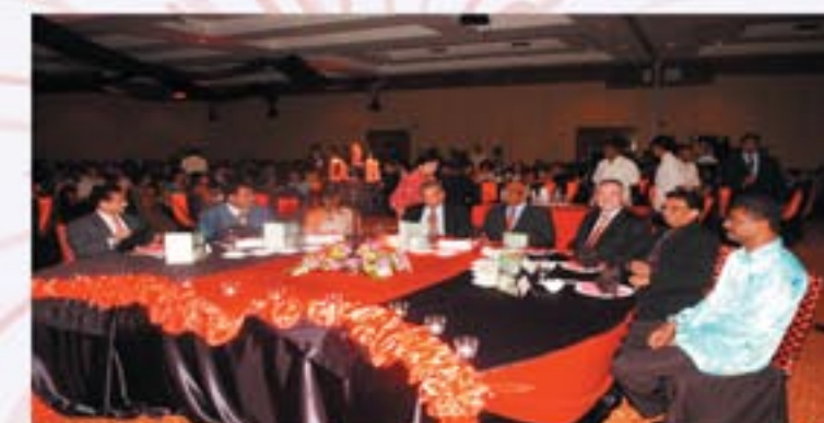
No woman no cry