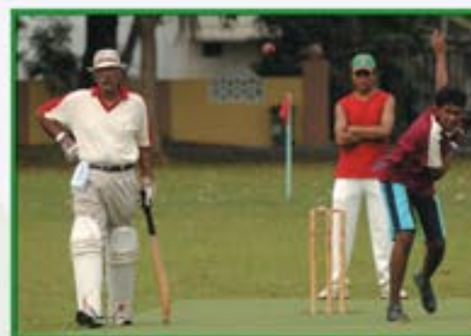
The Generation Gap