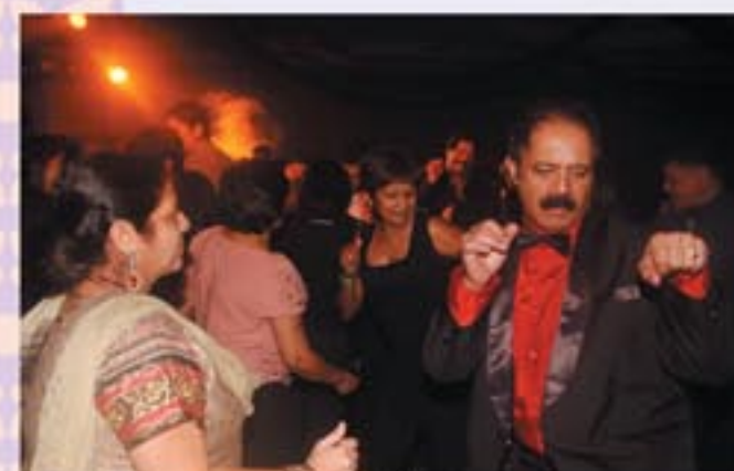
Hump de Bump