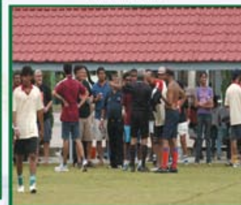
Ref. warns Hooligans?