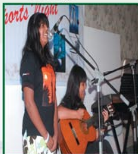
The Move Along Gals