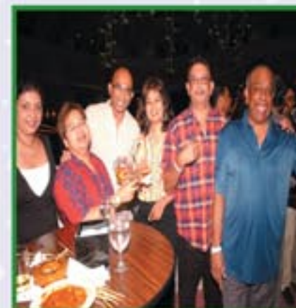
Life in the Fast Lane