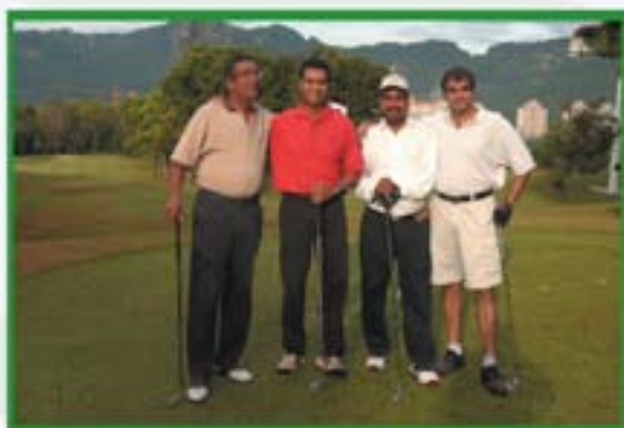
Boys & Toys