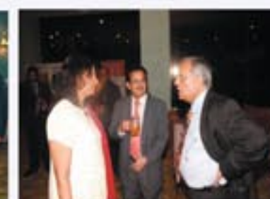
Quick Draw McGraw