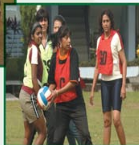
The Bionic Woman