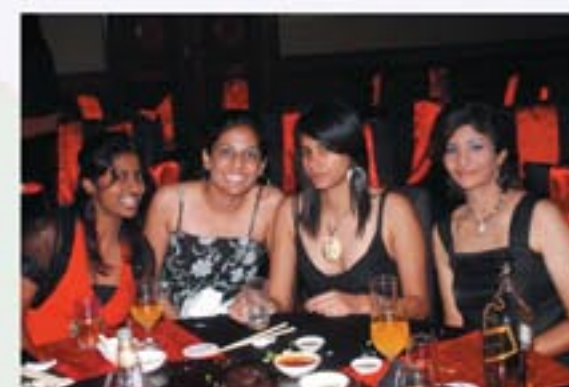
Girls that make me sigh