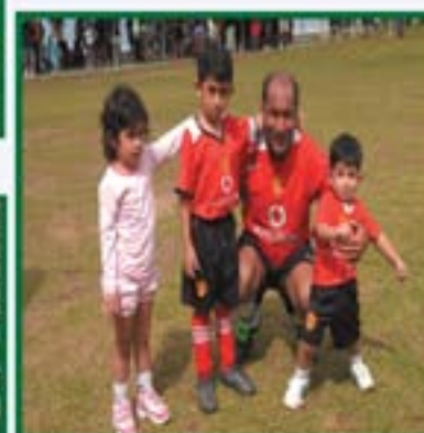
Aren't they adroable?