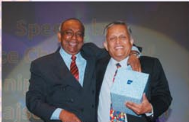
The Blues Brothers