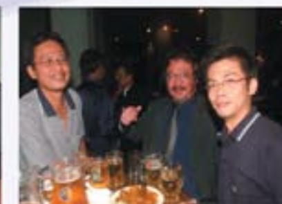
Free Beer mah