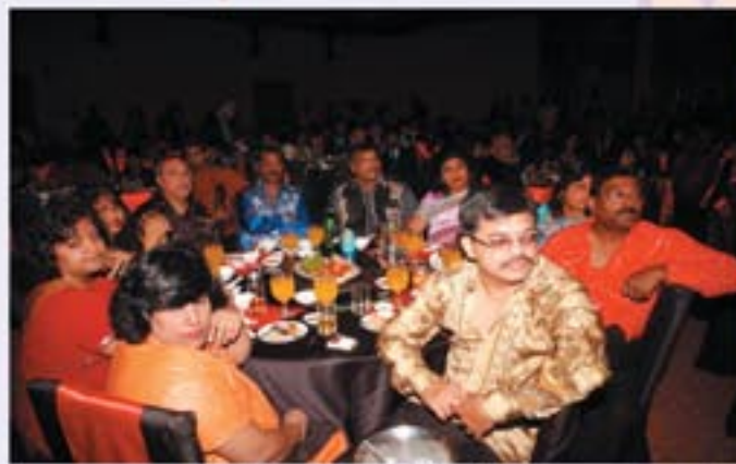
The Colours of Benetton