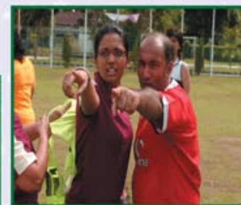
Is that Ayah Pin?