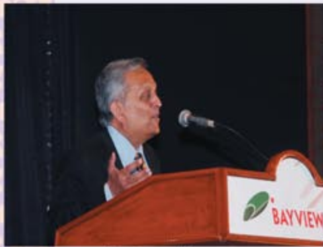
VC is Guest of Honour