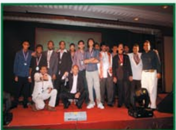
North Football Team