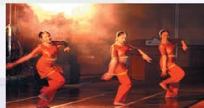
Inner Space Rocks