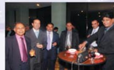
Thats my handbag