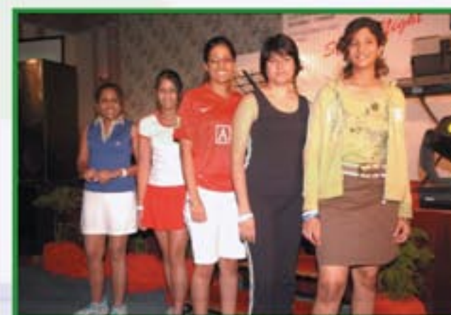
And the Winners is...