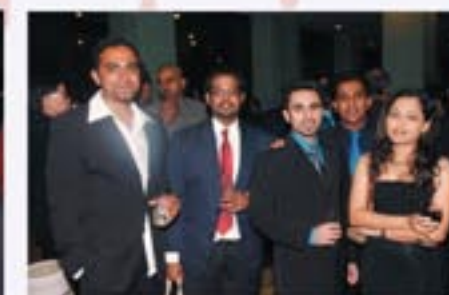
The Private Investigators