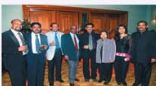
Judge & the Jury