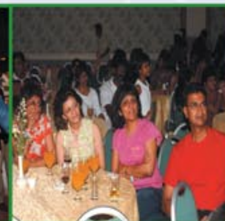
Girls that make me cry