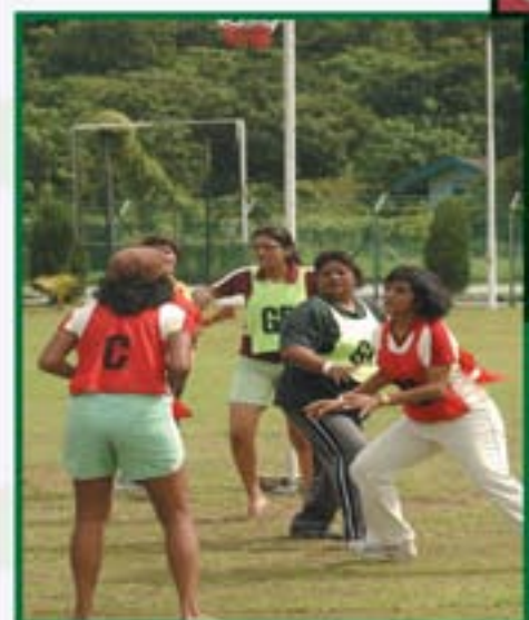
Poetry in Motion