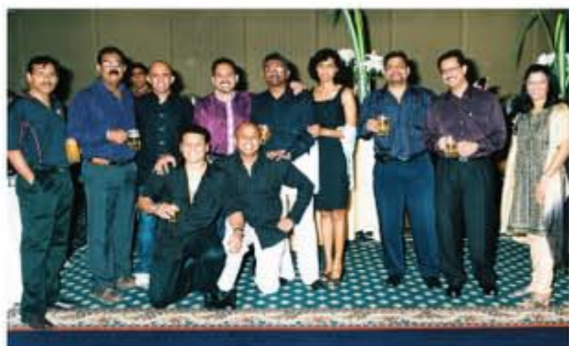
Reunion Dinner of the Kasturba Medical College Manipal, Class of 1988 - 1993 Legend Hotel, Kuala Lumpur, Malaysia, 9th August 2008

Reunion dinners are never dull, not when a bunch of rambunctious former classmates, some of us who have not seen each other for more than a decade, get together in a room. There were surprised wide-eyed enthusiastic shouts of joy along with hugs and kisses (some, just a good old handshake) at the reception hall when good friends greet each other during the pre-dinner cocktails and registration.