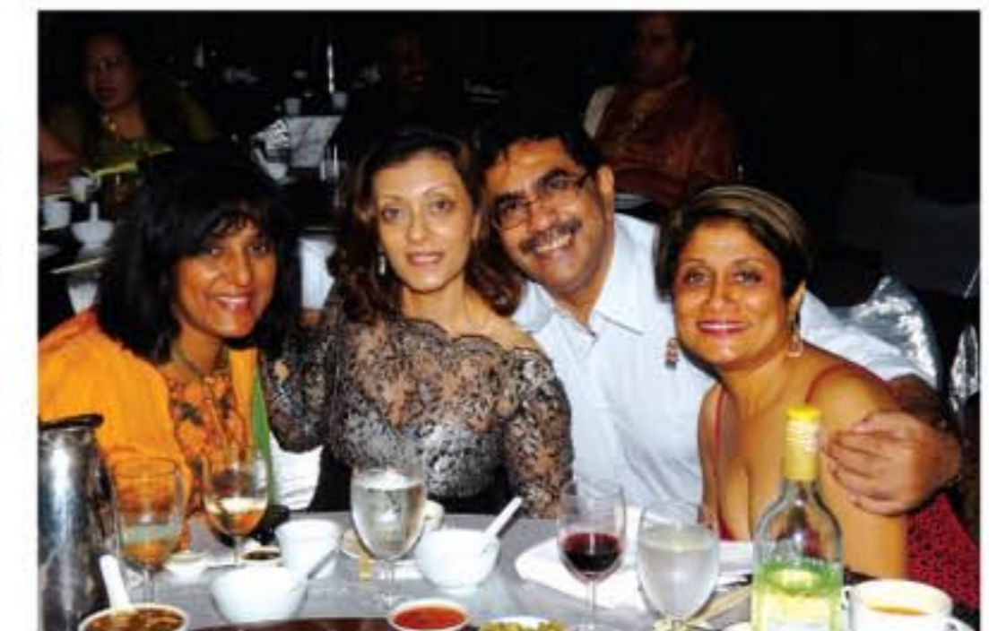
Official Secrets Actors