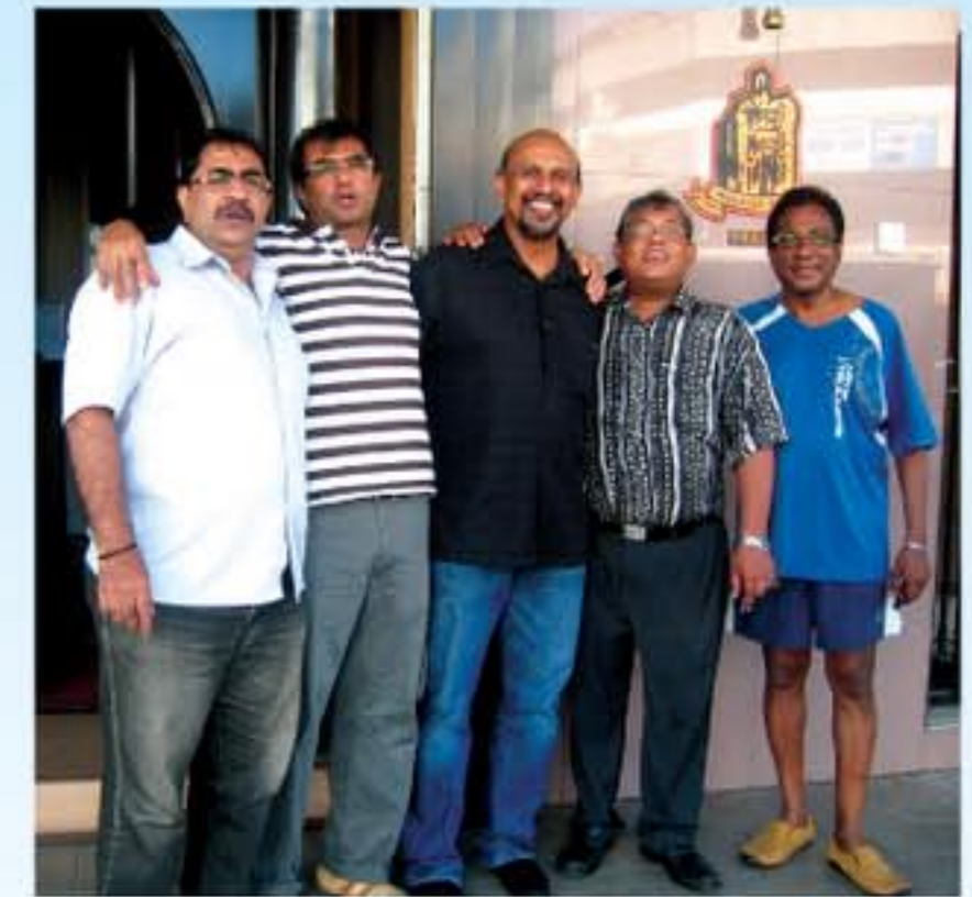
Outside Melaka Club